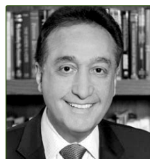
Hon. Henry Cisneros, Moderator former Mayor of the City of San Antonio and former U.S. Secretary of Housing and Urban Development